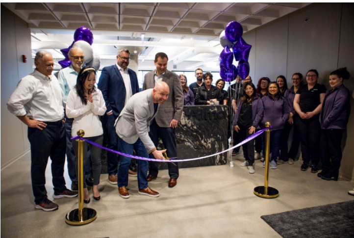
Alma 2: Spanning 10,605 square feet, the ninth floor of Fulton East will serve as the central location for Alma's North American operation team.